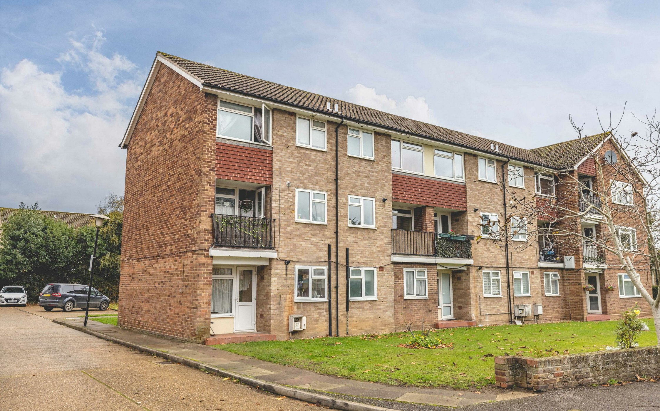
2 Montpellier Court, St. Leonards Road, Windsor, Berkshire, SL4 3DQ £335,000